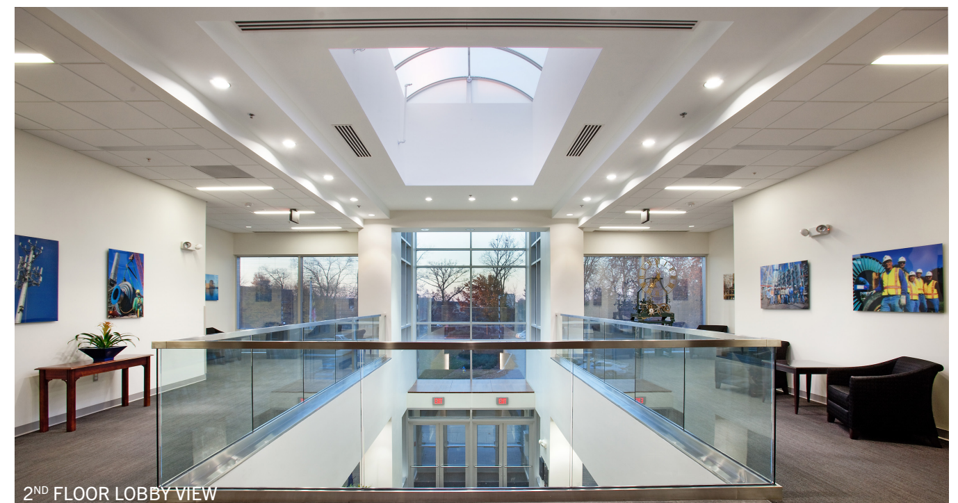
2ND FLOOR LOBBY VIEW