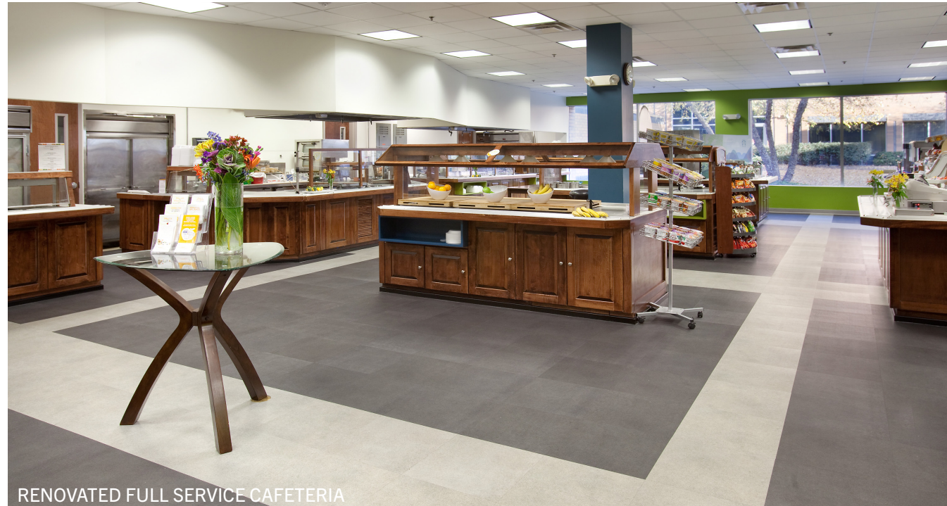
RENOVATED FULL SERVICE CAFETERIA