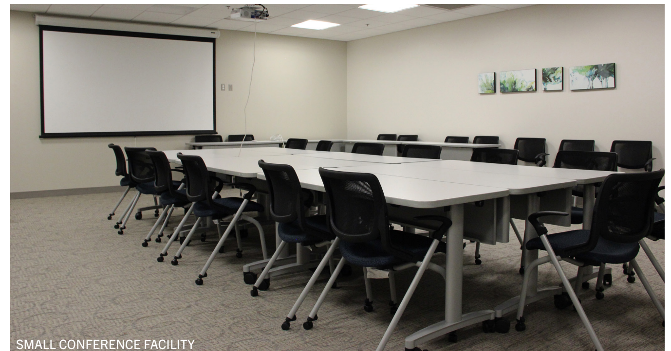
SMALL CONFERENCE FACILITY