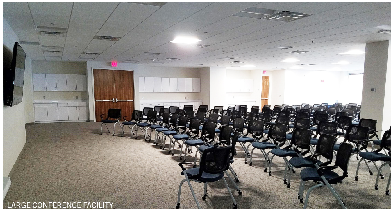
LARGE CONFERENCE FACILITY