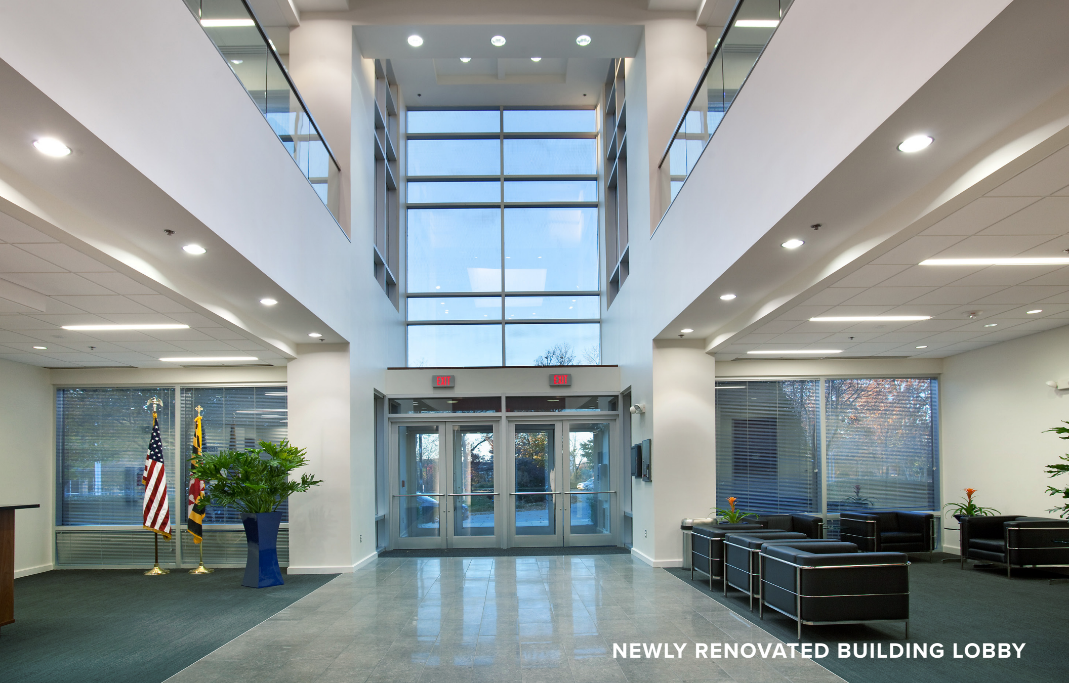
NEWLY RENOVATED BUILDING LOBBY